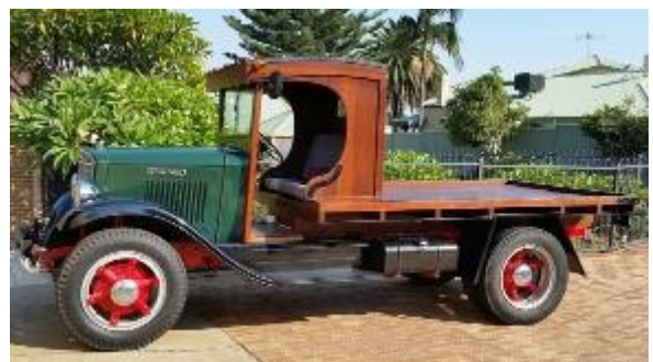
My 1936 International had it's first public outing in 39 years.